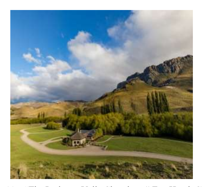
Fig. 11 – "The Lodge at Valle Chacabuco" Eco Hotel, Chile

Hiking, scenic camping and guided hikes are available for guests. Mountain houses made of stone mined in the valley are finished with marble and recycled wood and operate in accordance with strict green policies regarding the use of electricity and biodegradable cleaning products. The park is protected by several thousand square kilometres of land where herds of guanacos and deer graze, flocks of pink flamingos walk, foxes, armadillos, cougars and many other species of birds other and mammals roam [1].