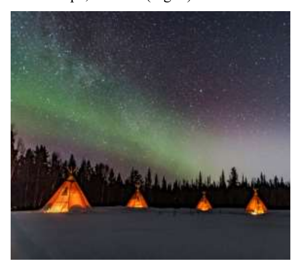
Fig. 9 - Eco Camp "Sápmi Nature Camp", Sweden

Eco Camp "Sápmi Nature Camp", Sweden (Fig. 9).