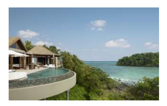
Fig. 3 - Eco Resort Song Saa, Cambodia

The Eco-resort Song Saa occupies a separate island at the Koh Rong archipelago in Cambodia and does not occupy the last place in the protection of the nature in this Asian country (Fig. 3).