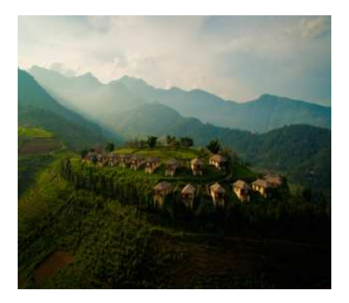
Fig. 8 - Topas Ecolodge Eco Hotel, Vietnam

The main part of the tour program here is a visit to mountain villages and the study of tribal culture. The hotel offers visitors locally produced goods, many outdoor activities,