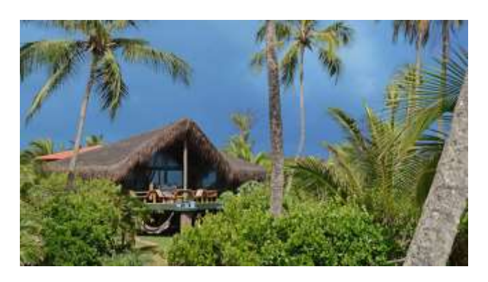
Fig. 4 - Eco Hotel Butterfly House Bahia, Brazil

Thatched roofs and rough walls of the Butterfly House Bahia and the inner surroundings of the bungalows and lodges are the exact opposite of their wild appearance (Fig. 4).