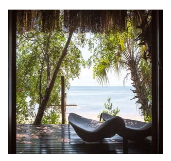
Fig. 7 - Eco Hotels Anantara Bazaruto Island Resort, Mozambique

largest network of eco-hotels in the world (44 resorts) (Fig. 7).