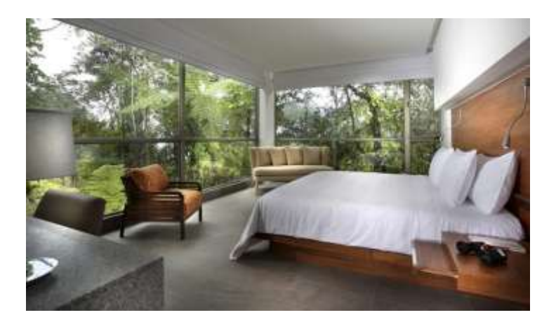
Fig. 2 – A room at the Eco Hotel Mashpi Lodge, Ecuador

As befits to a real eco-business, Mashpi Lodge is actively involved in the life of the local population, and also keeps a team of scientists who monitor the preservation and enhancement of the natural wealth of the equatorial lands. Thanks to their efforts, we can meet not only ferns and bromeliads, but also new varieties of orchids in the jungle in territory of the resort [8, 14, 17, 18].