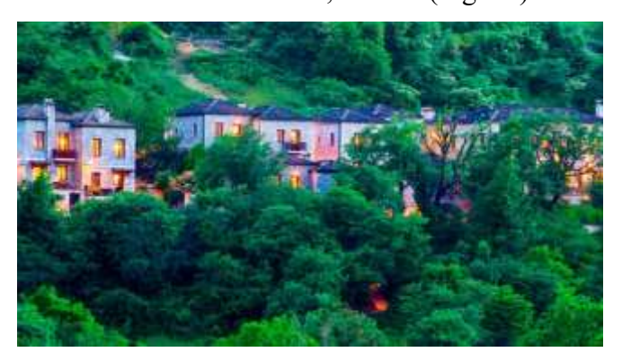
Fig. 10 - Eco Resort "Aristi Mountain Resort & Villas", Greece

Eco-resort "Aristi Mountain Resort & Villas", Greece (Fig. 10).