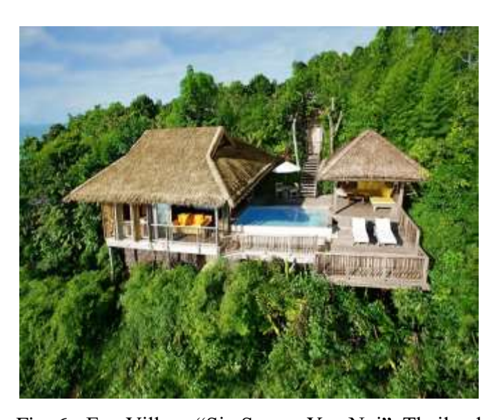
Fig. 6 - Eco Village "Six Senses Yao Noi", Thailand

Eco Village "Six Senses Yao Noi", Thailand (Fig. 6).